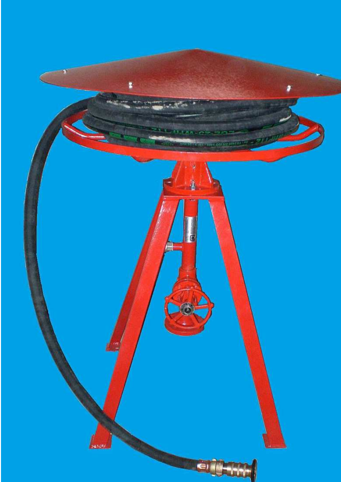
( VERTICAL LIVE HOSE REEL)

Drain Connection: ¾" Automatic Ball Drip Valve (Alternative: ¾" Ball Valve)